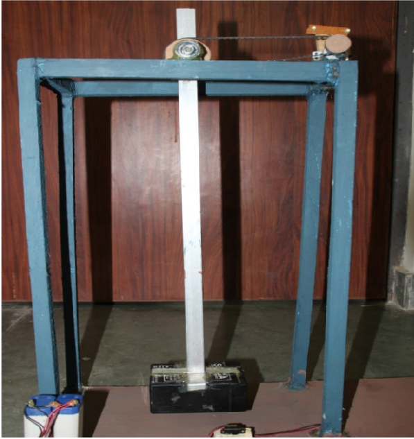
Fig. 1. Vertical Pendulum.