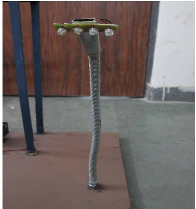
Fig. 4. LED Lamp.